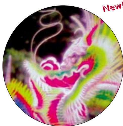
This is an actual photograph of a projected High Definition Photogobo.

Photogobos have a single plane of focus with photographic resolution. Shown is one example of this remarkable new process. Full color, high-resolution images can be made into a glass gobo.