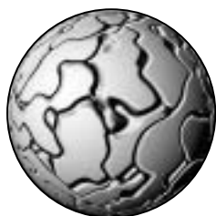
B&W High Resolution

There are five categories of Custom Spectrumgobos available: